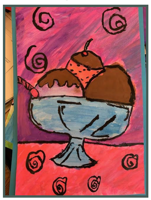
<u>View onomonomatopoeia art and other</u> <u>projects from Scotland here.</u>